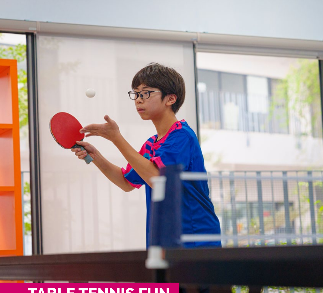
TABLE TENNIS FUN

Table Tennis Club is an exciting and active space where students develop their skills, reflexes, and sportsmanship through fun table tennis games and drills.